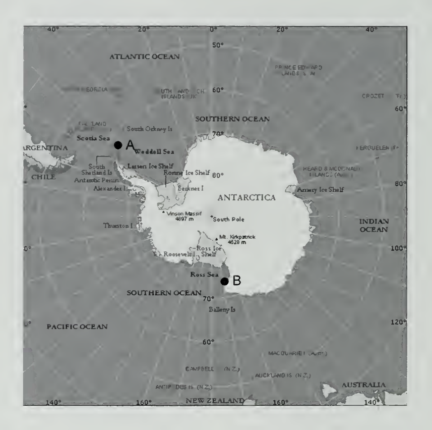
Fig. 10. Distribution map A. Type locality of T. araios n. sp. B. Type locality of T. coulmanensis

Etymology. argios (Greek): thin, weak, slight (from the very thin and weak shell).